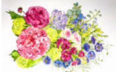
A Sue Bedford original watercolour.

WATERCOLOUR classes run by Sue Bedford (Assembly Rooms)