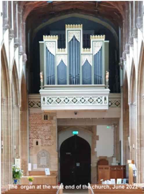
The organ at the west end of the church, June 2022

Back in the summer of 2018, I wrote an article for this very publication explaining the need to urgently explore solutions to our ever-more fragile and unreliable Hill pipe organ.