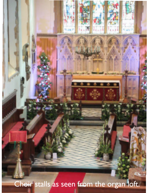
Choir stalls as seen from the organ loft.