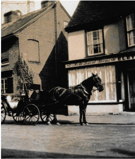
Eley's Refreshment Rooms at London House in the early 20th century. The tea garden was behind the house.