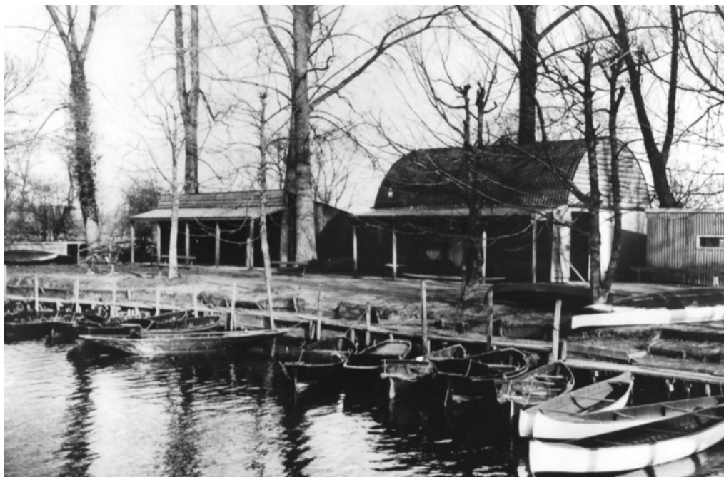
The Boatyard with rowing boats and canoes in 1934. The round-topped corrugated iron shed was bought second-hand from Courtaulds in Halstead