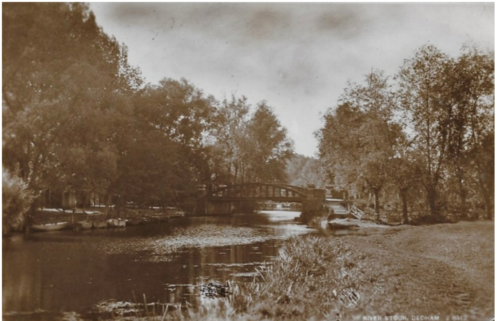
The boatyard in the early twentieth century beside the new Dedham bridge installed in 1900. Note to its right the wooden planking of the surviving tow path across the tributary